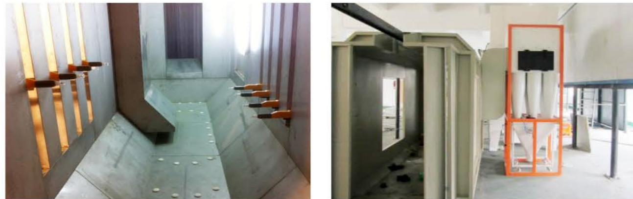
inside of powder spray booth