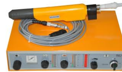
COLO-PGC1-opti-Auto Simple, durable, cost-effective

COLO provides coating performance , easy of cleaning ,simplicity ,to allow you to increase your productivity and color changes even faster!