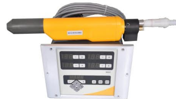
COLO-opti-auto Advanced, efficient and intelligent